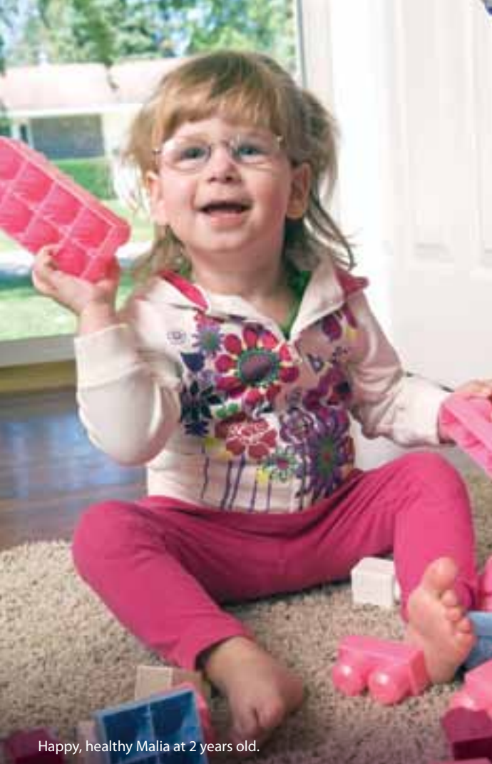
Happy, healthy Malia at 2 years old.