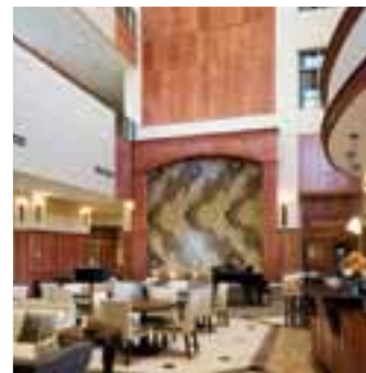
Lobby of Methodist West

A full-service community hospital specializing in orthopaedic, cardiac, maternity and emergency care, Methodist West has quickly become a hospital of choice for many patients. In terms of joint replacement procedures, Methodist West is on pace to the lead the state in successful procedures.