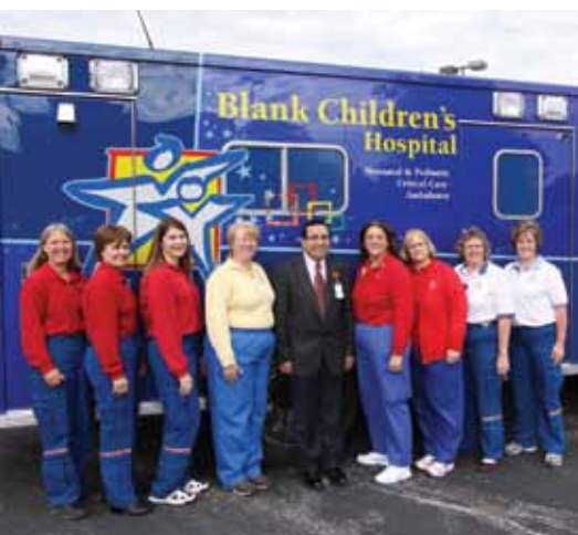
Neonatal Intensive Care Unit Transport Team in front of the new Pediatric Ambulance at Blank Children's Hospital