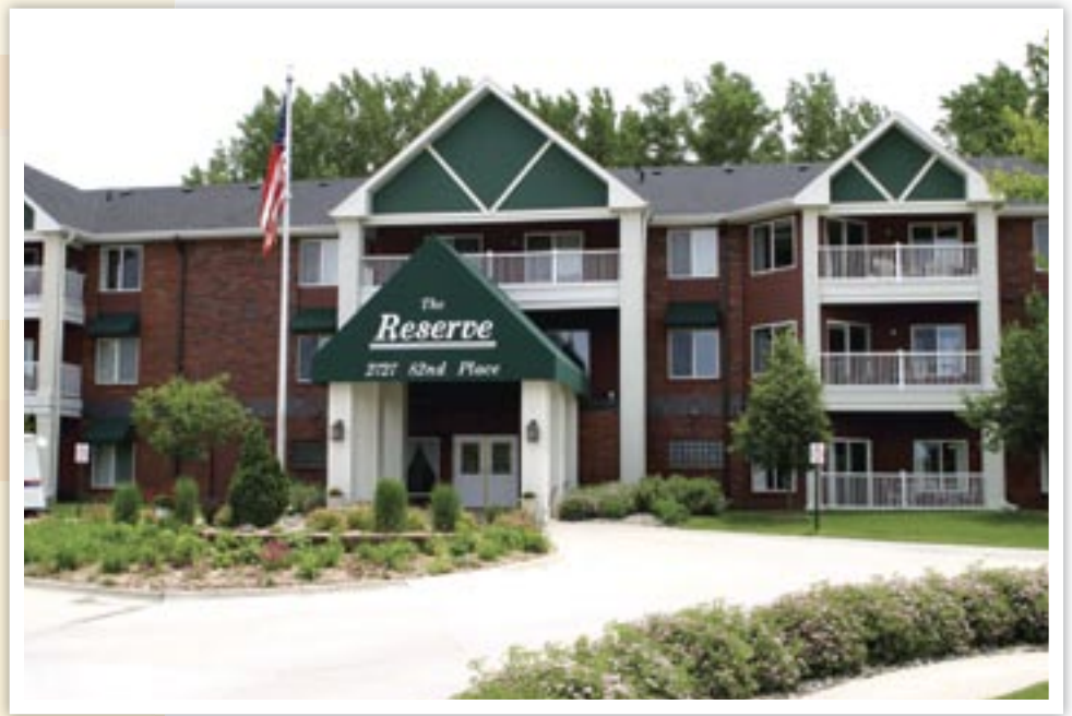
The Reserve on Walnut Creek: located at 2727 82nd Pl., Urbandale, IA